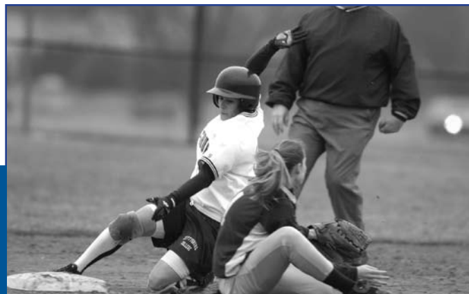
Do great work

A humbled person with definite drive and ambition, this alumna knows she has been fortunate to be a Bullet!