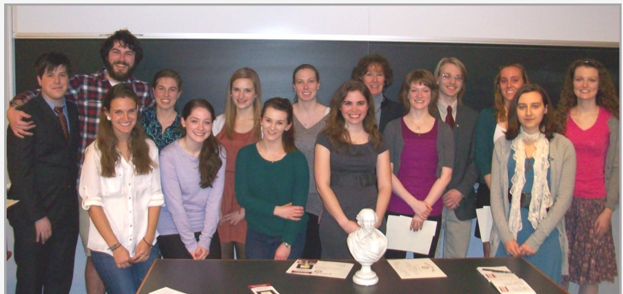
Inductees to Sigma Tau Delta, 12-13

On April 16, Sigma Tau Delta will host a grad school panel where students, faculty, and recent graduates will offer their advice about MFAs and other graduate school programs. In May, the Better World Books book drive will allow students to donate their unwanted textbooks to a great cause.