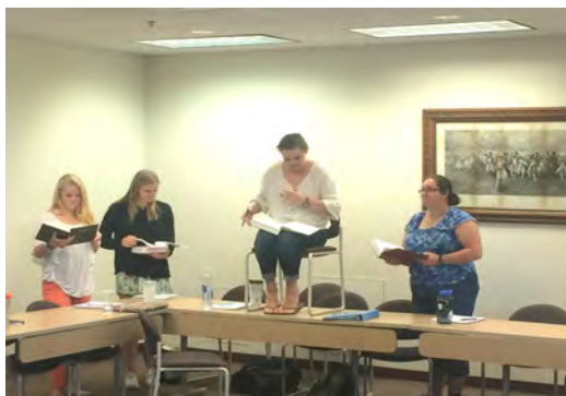
King Herod giving orders and taking names.