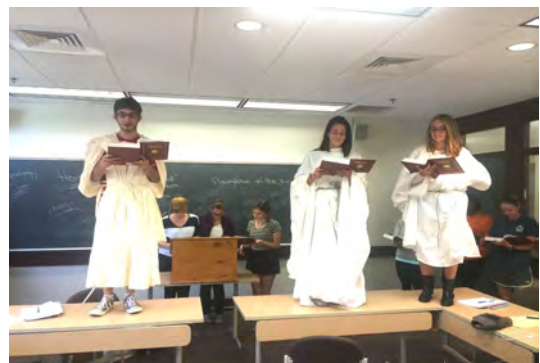
Singing angels opening the play.