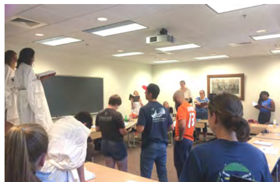
The entirety of the cast.