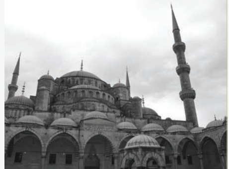
Little Mermaid Statue in Copenhagen, Denmark, and Blue Mosque in Istanbul