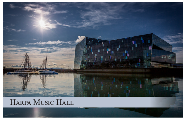
HARPA MUSIC HALL

SATURDAY, NOVEMBER 6 TH - Our excursion today takes us along the south coast of the island to Vik. At Vik, we'll stop at the black volcanic beach south of the village - from here you can view the rock formations Dyrhólaey and Reynisdrangar. After a stop for lunch, we visit the fairytale-like Seljalandsfoss waterfall, where you can experience walking right behind the misty cascade, and the gorgeous 60-metre high Skógafoss waterfall, just a short drive down the road. Heading back to Reykjavik, we will stop at the renowned Fjoruborðið restaurant in the village of Stokkseyri, where a traditional Icelandic lobster feast awaits us (more like Langoustine than Maine lobster). (B, D) OVERNIGHT: REYKJAVIK